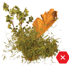
No Yard Waste