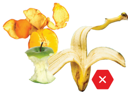
No Food or Liquids