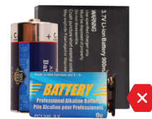
No Hazardous Waste or Batteries