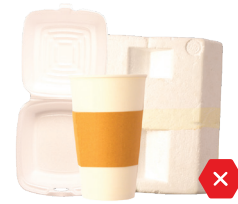
No Foam Cups & Containers