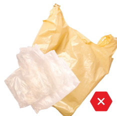
No Loose Plastic Bags, Recyclables in Plastic Bags, or Film Empty recyclables directly into your cart