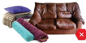
No Clothing, Furniture or Carpet